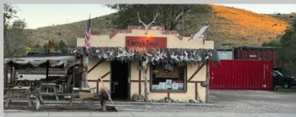
412 E. Holland Alpine, Tx Town Gem $363,000