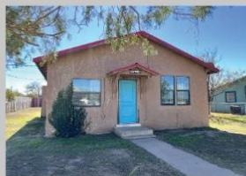
1210 E Ave F Alpine, Tx 2 Bed, 1 Bath $149,000