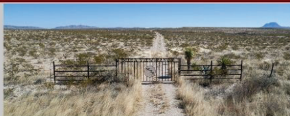
49229 S. Hwy 118 Mesa View Ranch Alpine, Tx 1,625 Acres $1,990,625