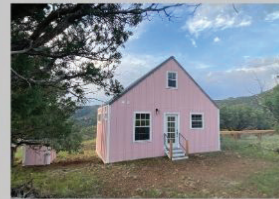
203 Low Meadow Fort Davis, Tx 1 Bed, 1 Bath $239,500