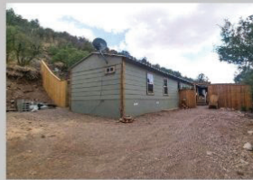
412 Squaw Valley Fort Davis, Tx 4 Bed, 2 Bath $199,000