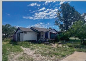
1202 N 5th Alpine, Tx 4 Bed, 2 Bath $149,000