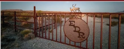
49405 S. Hwy 118 Elk Draw Ranch Alpine, Tx 3,100 Acres $2,635,000