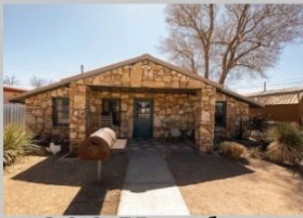
200 Urquhart Fort Davis, Tx 4 Bed, 3 Bath $355,000