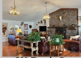
311 Davis St. Fort Davis, Tx 3 Bed, 2.5 Bath $779,000