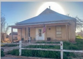
207 Fannin Ave Van Horn, Tx 2 Bed, 1 Bath $94,000