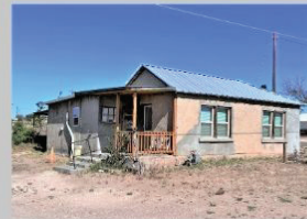
200 S. Hartford Marfa, Tx 2 Bed, 1 Bath $320,000