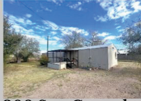
308 Sgt. Gonzales Fort Davis, Tx 5 Bed, 4 Bath $109,000|2 homes