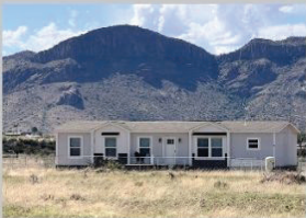
123 McBride Alpine, Tx 3 Bed, 2 Bath $299,000