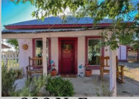
206 N. Front Fort Davis, Tx 1 Bed, 1 Bath $139,000