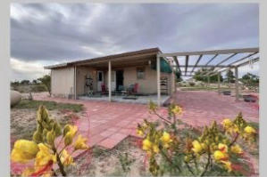
708 N. Ave K Marathon, Tx 1 Bed, 1 Bath $269,000