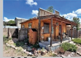
205 Court Ave Fort Davis, Tx 1 Bed, 1 Bath $159,000