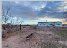
331 F.M. 867 Alpine, Tx 4 Bed, 2 Bath $525,000