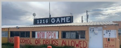
341 FM 1216 Pecos, Tx Income Producing $1,200,000