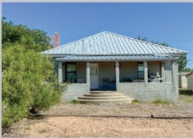
506 W. Texas Marfa, Tx 3 Bed, 3 Bath $594,000