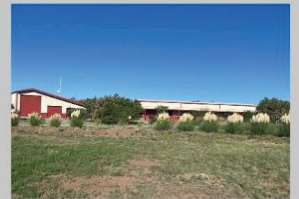
100 Acacia Alpine, Tx 2 Bed, 2.5 Bath $644,000