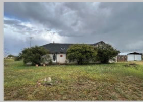
1 Quail Run Alpine, Tx 3 Bed, 2 Bath $289,000