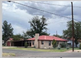
1108 N 5th Alpine, Tx 2 Bed, 1 Bath $289,000