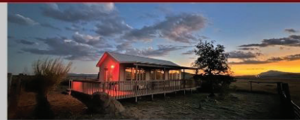
3300 E. Comprise St. Riegel Ranch Fort Davis, Tx 119 Acres $1,700,000