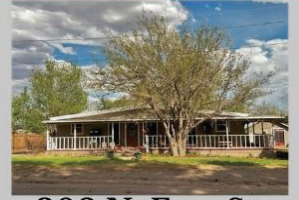
302 N. Fort St. Fort Davis, Tx 3 Bed, 2 Bath $269,000