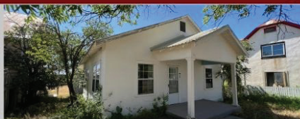
214 Persimmon Ave. Sanderson, Tx Church & Parsonage $209,000