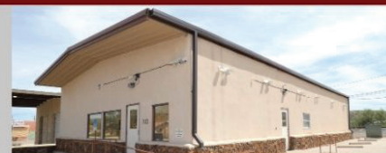
712 N. Holland Ave. Alpine, Tx 6 Offices|Ample Parking $349,000