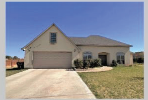
112 Deer Run Alpine, Tx 4 Bed, 3 Bath $448,000