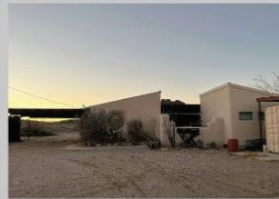
4000 S. County Terlingua, Tx 2 Bed, 2 Bath $400,000