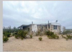
2500 Agua Frida Terlingua, Tx 2 Bed, 2 Bath $350,000