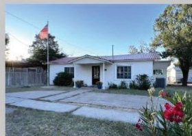
505 Ave B Alpine, Tx 3 Bed, 2 Bath $254,000