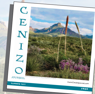
Satal and Cenizo bloom after Summer rains in Big Bend National Park - TIM MCKENNA